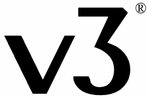
v3 Registered Trademark Logo